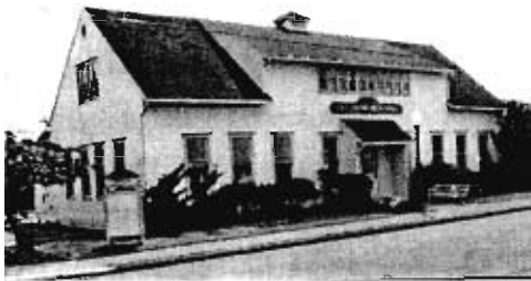
Siuslaw Pioneer Museum. Association, Inc. a non-profit Corporation

Process; subject to editing, omissions, revisions.