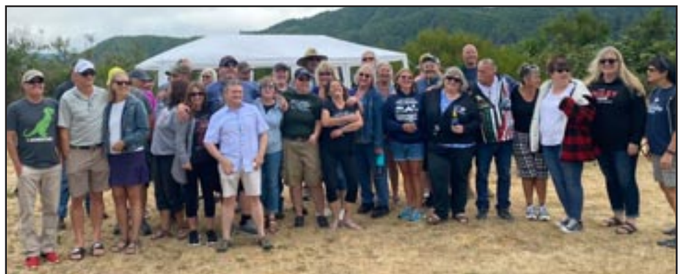
Class of 1982

You can still submit your 2023 class reunion information and we will post on SiuslawAlumni.org and the Siuslaw Alums Facebook page. Email siuslawalumniassn@gmail.com .