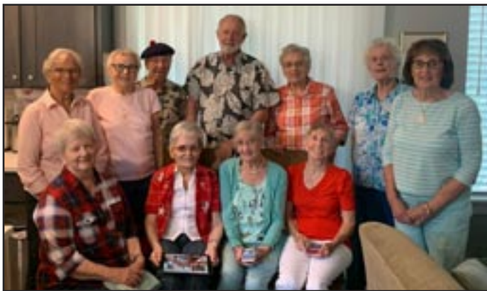
Class of 1954