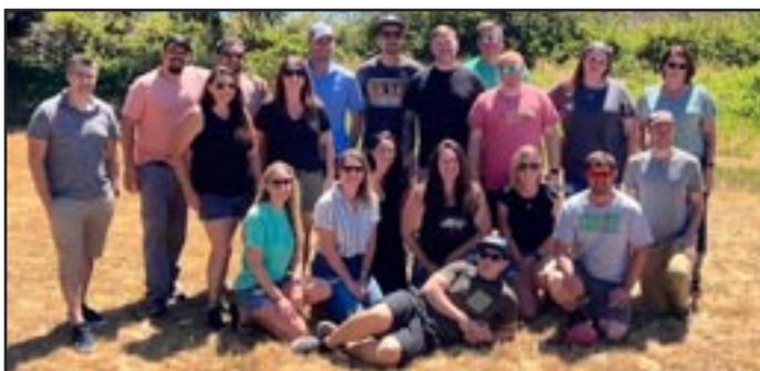
Class of 2000

You can still submit your 2023 class reunion information and we will post on SiuslawAlumni.org and the Siuslaw Alums Facebook page. Email siuslawalumniassn@gmail.com .