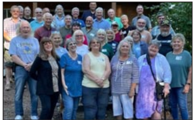
Class of 1972