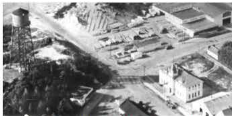
Old Siuslaw School - Maple Street - 1946