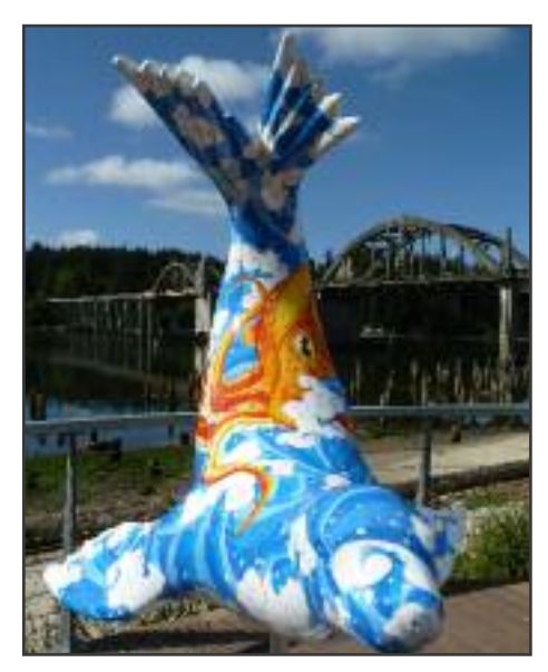
"Umi No Nami" on Bay Street

This summer Florence will be filled with a colorful colony of sea lions. Twenty life-size fiberglass sea lions frolic in front of local businesses from Newport to Reedsport. This fundraiser for the Florence Event Center celebrates their 20th